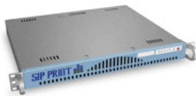
SIP Print VoIP call recording appliance